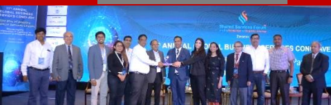
HINDUSTAN COCA COLA BEVERAGES