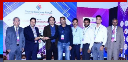
ANZ BENGALURU HUB