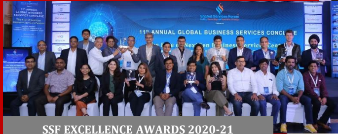
SSF EXCELLENCE AWARDS 2020-21