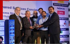
DR REDDY'S LABORATORIES