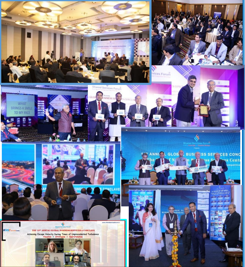
A Cross-Section of Audience at the Annual Conclave